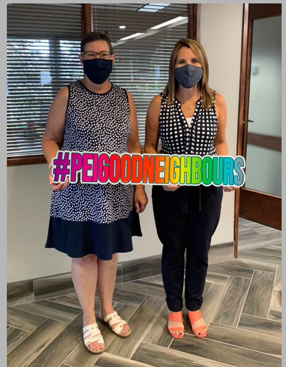
Stella Maris Branch