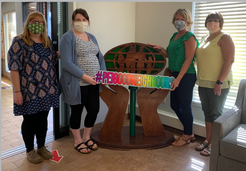
Malpeque Bay Branch